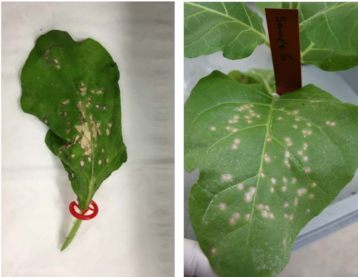
Figure 3. Lesions on a tobacco leaf inoculated with ToBRFV-infected tomato leaf (left) and tobamovirus-infected seed extract (right)